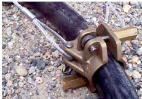
Brass Cable Clamp